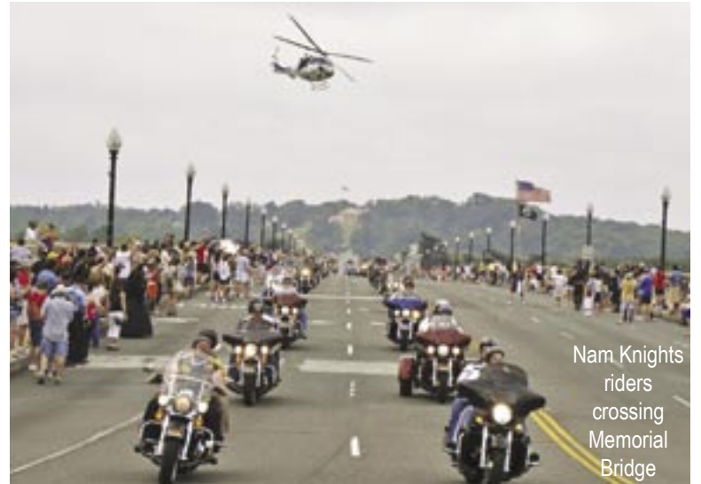
Nam Knights riders crossing Memorial Bridge