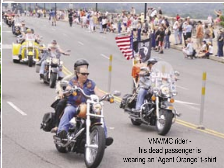
VNV/MC rider - his dead passenger is wearing an 'Agent Orange' t-shirt