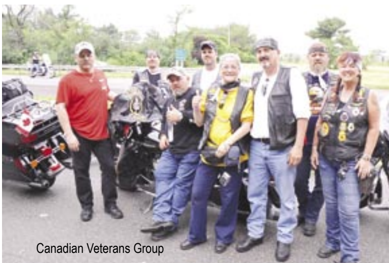
Canadian Veterans Group