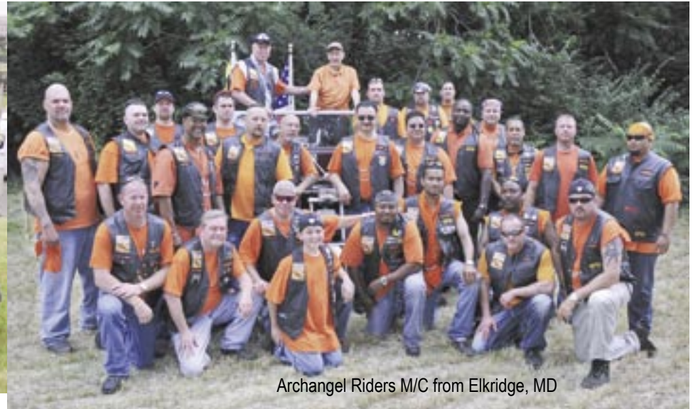
Archangel Riders M/C from Elkridge, MD