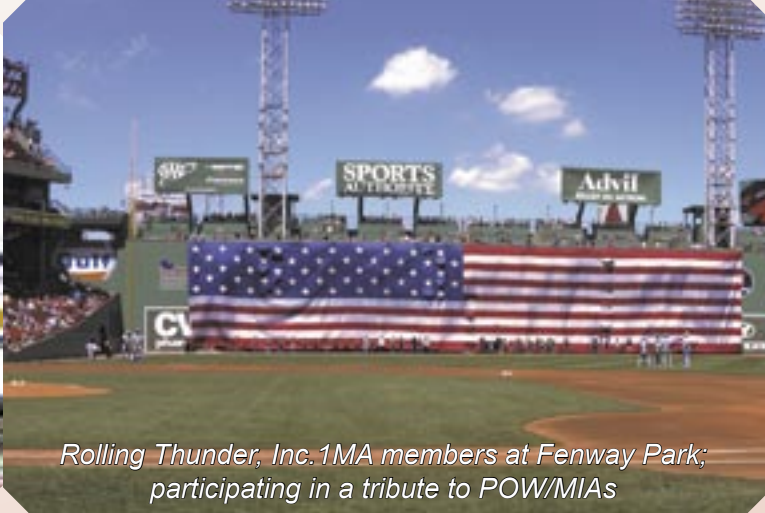
Rolling Thunder, Inc. 1MA members at Fenway Park; participating in a tribute to POW/MIAs